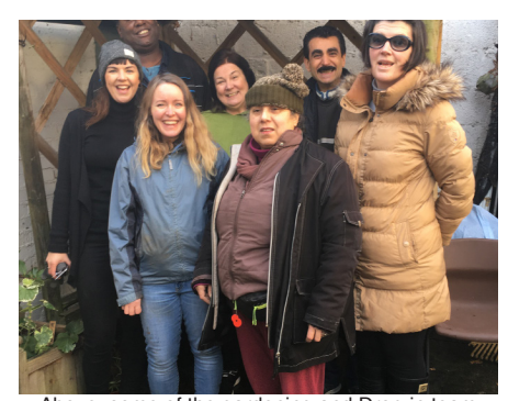
Above: some of the gardening and Drop-in team